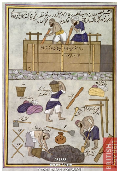
Fig 3 - Farsi manuscript written in the mid 19th century in Srinagar, India (British Library, London)

Figure 3 shows a copy of a Farsi manuscript, part of a larger collection held at the British Library and drawn around the middle of the 19th century describing all types of construction techniques in Srinagar at that time. This manuscript clearly shows the type of formwork adopted, the size and shape of the rammers, and other implements used in construction. The formwork is clearly supported from within the wall, leading to the characteristic ‘putlog’ or formwork support holes seen in the walls at Basgo. Unfortunately only one layer of construction is shown, rendering it impossible to determine how the next lift was formed. The rammer takes the form of a double ended timber, around 1.5m long, with a thinner section in the center.