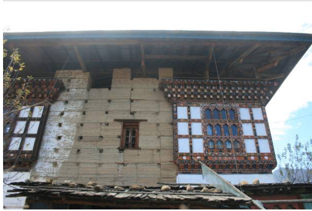
Fig 6 – Rammed earth section of Kyichu Lhakhang monastery, built around 1700