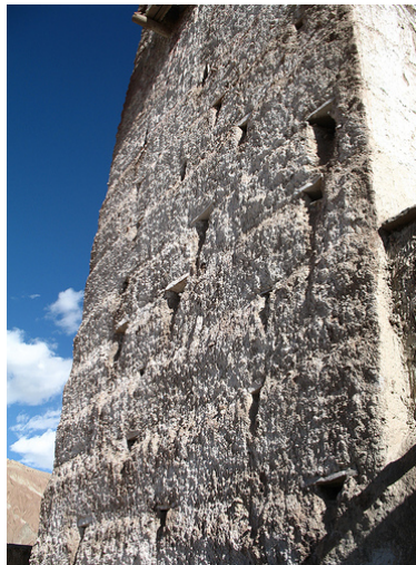
Fig 1 - Basgo fort, possibly constructed before 1357

Figure 1 shows a section of the wall of the fort at Basgo (Rabtan Lhartsekhar Castle). Basgo was the capital of Ladakh before 1357, and it is possible that the castle dates from this period. The wall outer face forms a stepped batter, each lift slightly inset from the one below. Such a batter is constructed by the formwork for a higher lift being rested on the edge of the lower lift, each lift of rammed earth thus becoming progressively thinner towards the head of the wall.