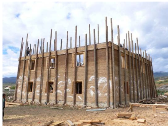
Fig 10 – New rammed earth building in Shangri-La (Zhongdian) County, Yunnan (Rutherford)