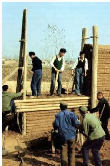
Fig 9 – Modern rammed earth construction, Xi'an region (Maini)