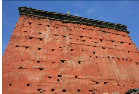
Fig 4 – Kag Chode Thupten Samphel Ling monastery, Kagbeni

Figure 4 shows the monastery of Kag Chode Thupten Samphel Ling established in 1429. The rammed earth walls do appear to taper, but with significantly less of a step than seen in Ladakh. In addition, the walls contain many of the characteristic 'putlog' holes used to support formwork. It is also interesting to note that large timbers are embedded into the walls, which are likely to be provided to improve the seismic resistance of the structure.