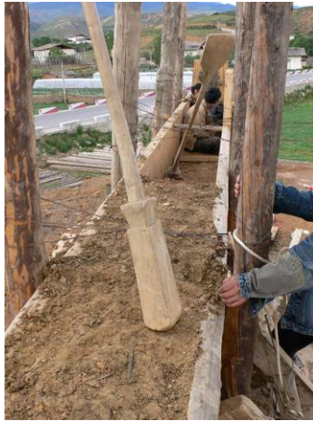
Fig 11 – New rammed earth building in Shangri-La (Zhongdian) County, Yunnan. Rammer detail (Rutherford)