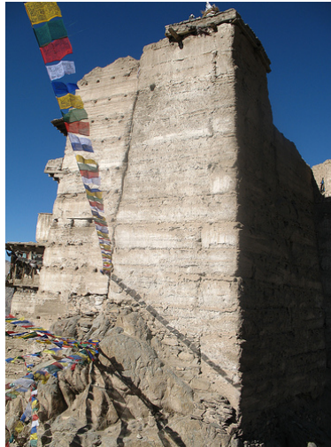
Fig 2 - Leh fort, constructed around 1555

not show any holes, indicating that the formwork must have been supported from the base of the wall. Both sections of wall step back as they rise, as seen at Basgo (Jaquin, 2008).