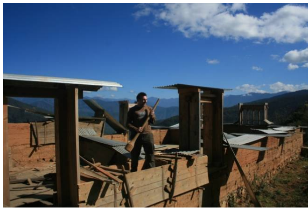
Fig 7 - Modern rammed earth in Bhutan