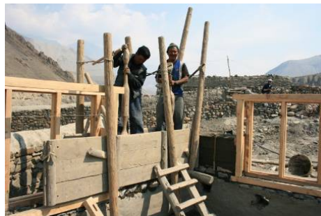
Fig 5 – Modern rammed earth construction in Mustang

Figure 5 shows modern rammed earth construction taking place in Kagbeni, but here the construction technique is different to that used in the monastery. Here vertical poles are fixed to the ground, and tied at the top by ropes. These timbers are tightened against the wall using wedges, and earth is rammed into place. The rammers are timber with cylindrical centers and double headed, with one end round and the other flat, to enable ramming against the flat formwork.