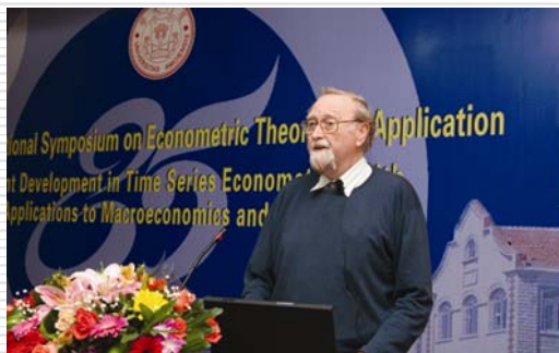
Prof. Clive Granger, 2003 Nobel Laureate for Economics